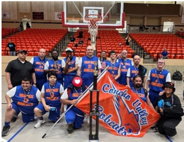
Concho Valley Bobcats