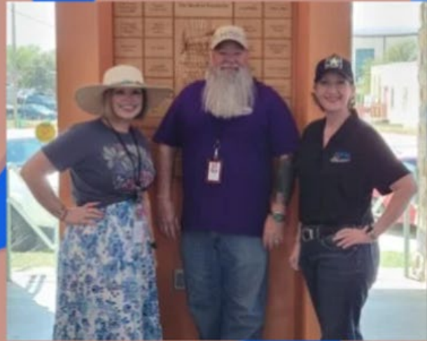
03/25/2025 - Hat Day