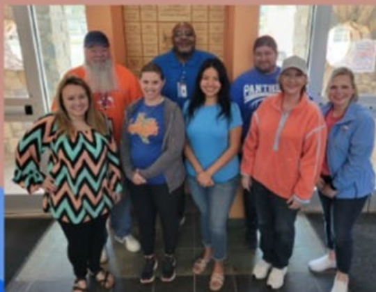
03/27/2025 - Orange and Blue