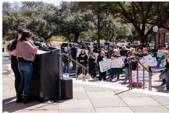
San Angelo C