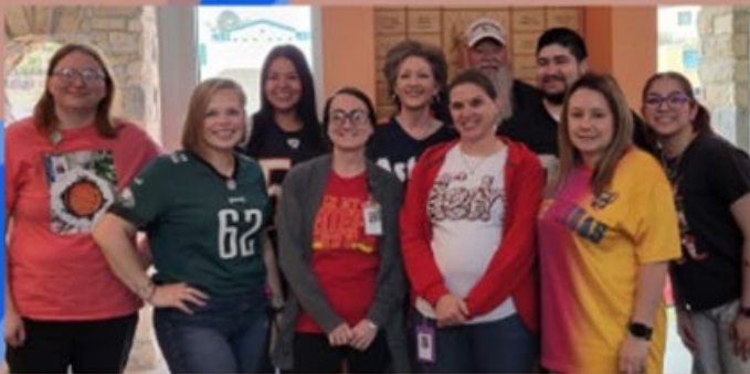
03/26/2025 - Jersey Day